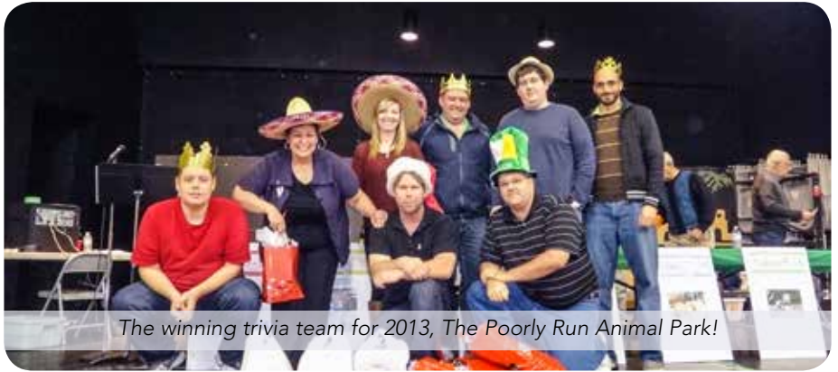
The winning trivia team for 2013, The Poorly Run Animal Park!

Thanks to everyone who made it out to the SOLD OUT event! Over 450 two-legged participants and 30 four-legged participants enjoyed an evening of Trivia and raised over $15,000!