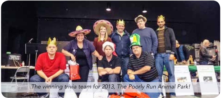
The winning trivia team for 2013, The Poorly Run Animal Park!

Thanks to everyone who made it out to the SOLD OUT event! Over 450 two-legged participants and 30 four-legged participants enjoyed an evening of Trivia and raised over $15,000!