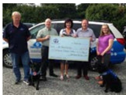
RCMP NATIONAL PUBLIC SERVICE WEEK $1,606.30 DONATION