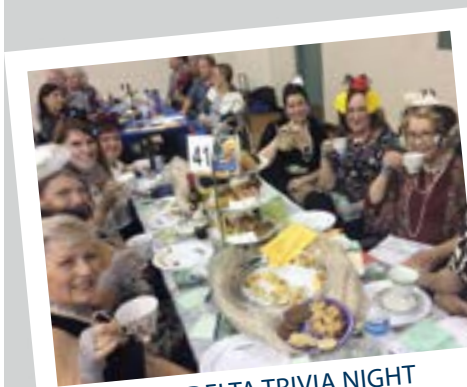
2016 DELTA TRIVIA NIGHT RAISED $18,000!