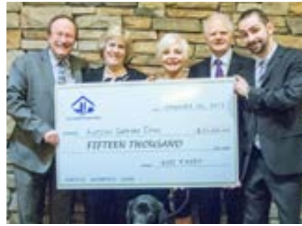
KITS4KIDS $15,000 DONATION