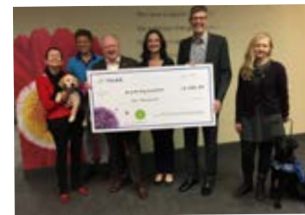
TELUS VICTORIA COMMUNITY BOARD TEAM DONATES $10,000!