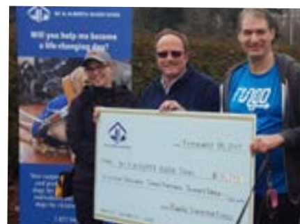
RUNGO DASH FOR DOGS $16,000 DONATION