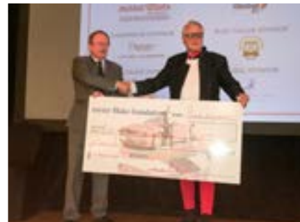
MISTER BLAKE FOUNDATION $5,000 DONATION