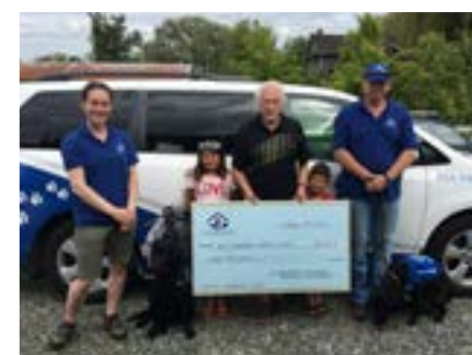
BC MASONIC FOUNDATION $3,000 DONATION

We are grateful to all of the individuals and businesses that choose to support us throughout the year! Your generosity helps provide Guide Dogs to blind/visually-impaired individuals and Autism Support Dogs to children with autism and their families!