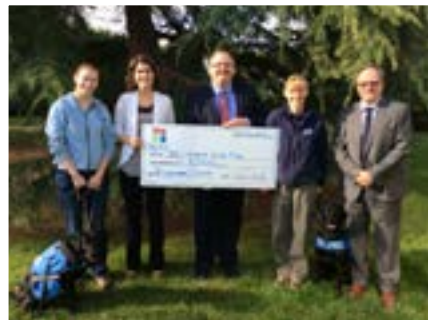
FIRST WEST FOUNDATION $1,000 DONATION