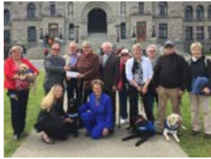
ORDER OF THE EASTERN STAR, OAK BAY CHAPTER $30,000 DONATION