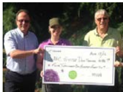
TEAM TELUS CHARITABLE GIVING PROGRAM $4,186.68 DONATION