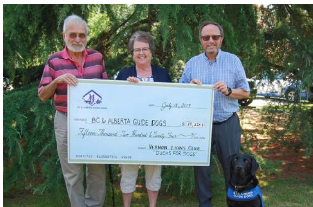
VERNON LIONS CLUB - DUCKS FOR DOGS $15,224.81 DONATION