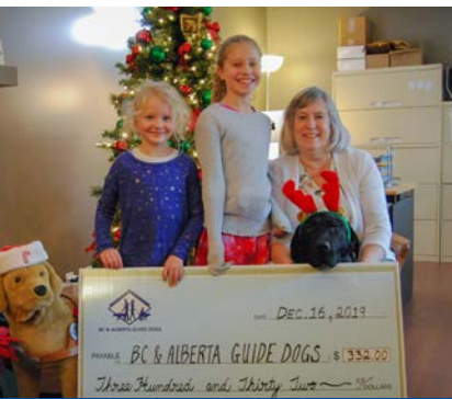
VANCOUVER MONTESSORI $332 DONATION