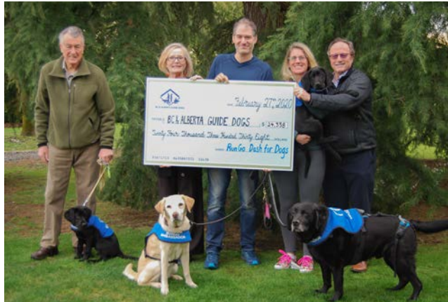
RUNGO DASH FOR DOGS $24,338 DONATION