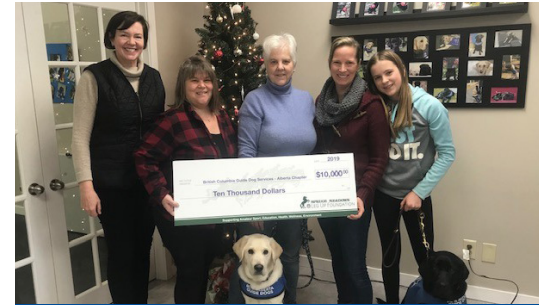
SPRUCE MEADOWS LEG UP FOUNDATION $10,000 DONATION