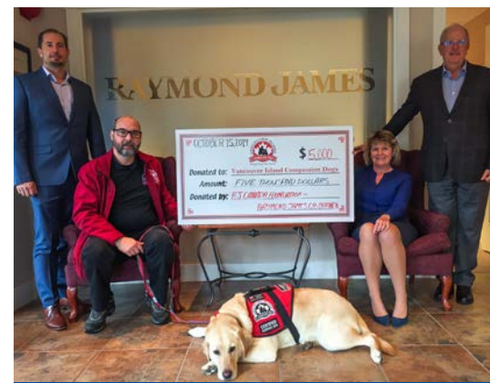
RAYMOND JAMES FOUNDATION $5,000 DONATION