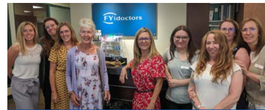
FYIDCTORS | VISIQUE $2,097 DONATION