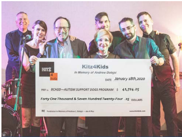
KITZ4KIDS $41,724.25 DONATION