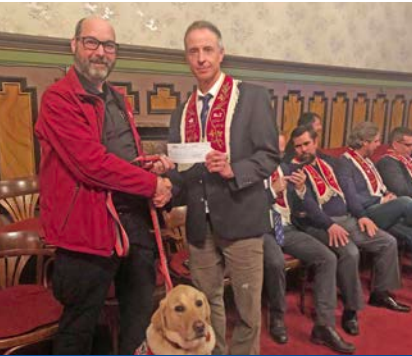
ORDER OF ODDFELLOWS COLUMBIA LODGE #2 $2,000 DONATION

We are grateful to the individuals and businesses that choose to support us throughout the year! Your generosity helps provide Guide Dogs to individuals who are blind/visually-impaired, Autism Service Dogs for children ages 3-10 with autism and their families, and PTSD Service Dogs for Veterans and First Responders living with Operational Stress Injuries.