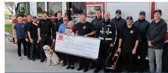
DELTA FIREFIGHTERS CHARITABLE SOCIETY $10,000 DONATION