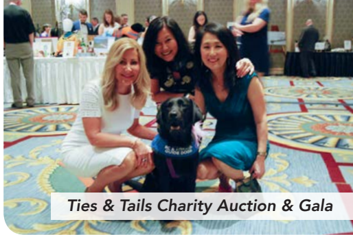
Ties & Tails Charity Auction & Gala