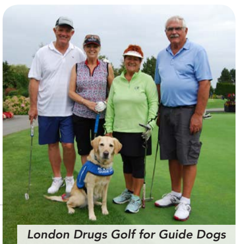
London Drugs Golf for Guide Dogs