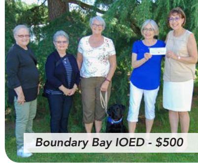
Boundary Bay IOED - $500