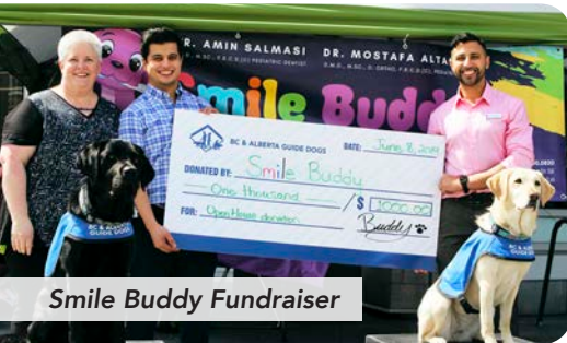
Smile Buddy Fundraiser