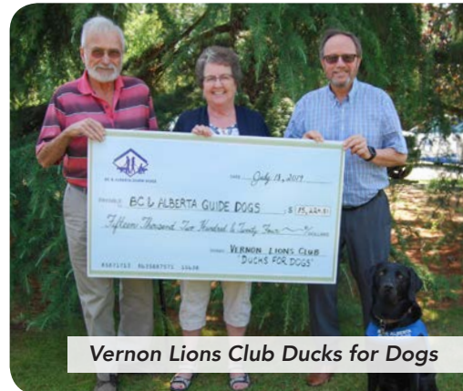
Vernon Lions Club Ducks for Dogs