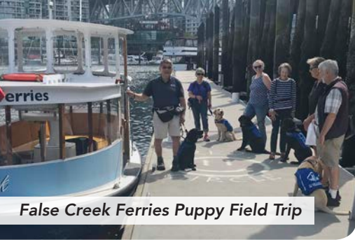
False Creek Ferries Puppy Field Trip