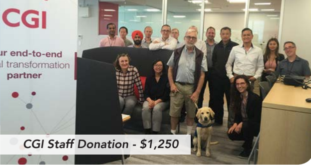
CGI Staff Donation - $1,250