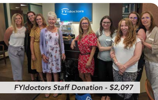
FYIdoctors Staff Donation - $2,097