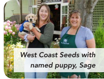
West Coast Seeds with named puppy, Sage