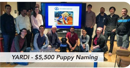
YARDI - $5,500 Puppy Naming