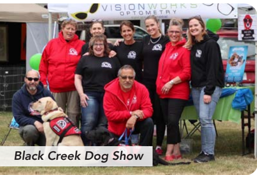
Black Creek Dog Show