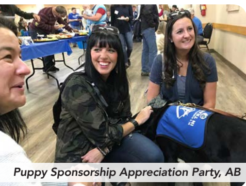
Puppy Sponsorship Appreciation Party, AB