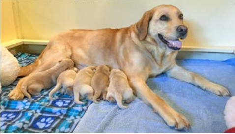
Nellie & Bert - July 22, 2019