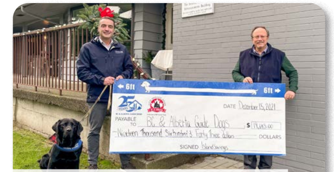
Island Savings $19,643