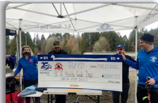
RunGo Dash for Dogs $23,837.45