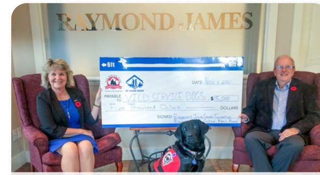
Raymond James Canada Foundation $5,000