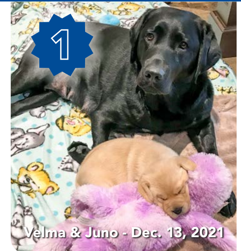
Velma & Juno - Dec. 13, 2021