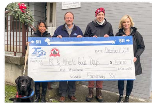
Fraserway RV Delta $5,000