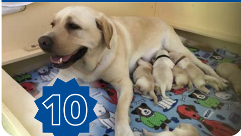
Penny & Felix - Sept. 2, 2020