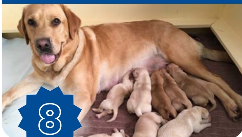
Roo & Gerry - Oct. 14, 2020