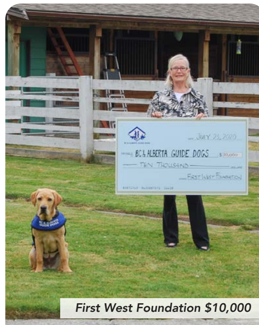
First West Foundation $10,000

Wesley handcrafted an amazing cigar box guitar and auctioned it off for $250 in support of VICD Service Dogs. Thank you for such a creative donation!