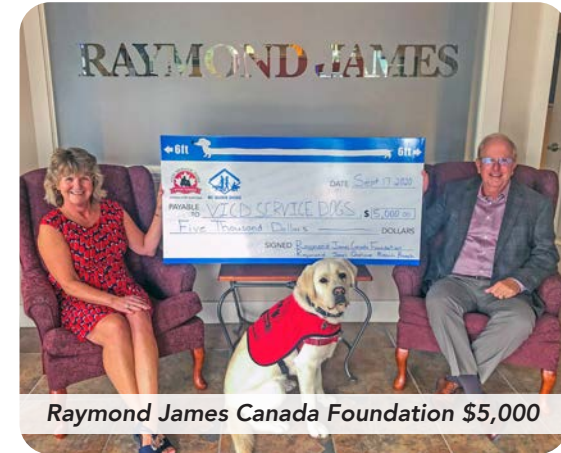
Raymond James Canada Foundation $5,000