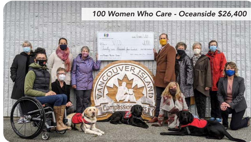
100 Women Who Care - Oceanside $26,400