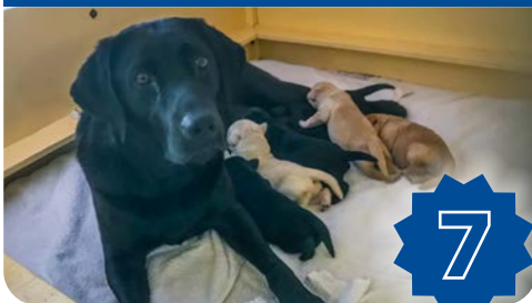
Taz & Finn - Oct. 6, 2020