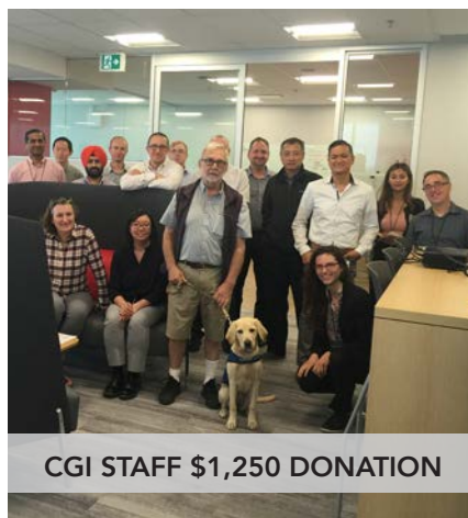
CGI STAFF $1,250 DONATION