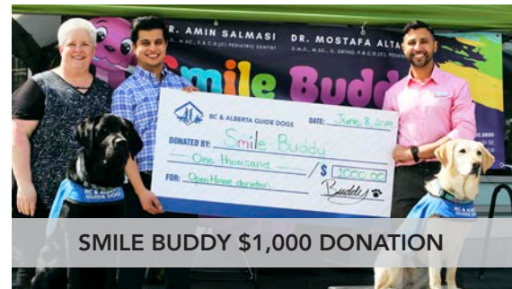
SMILE BUDDY $1,000 DONATION