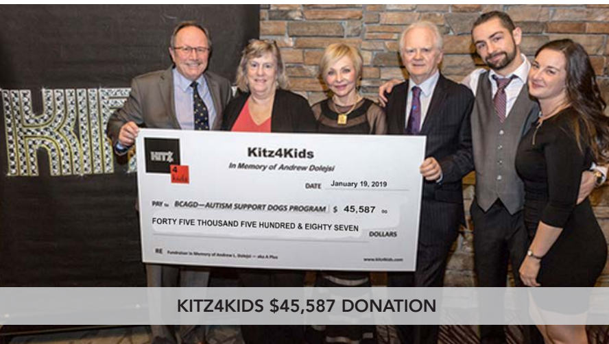
KITZ4KIDS $45,587 DONATION