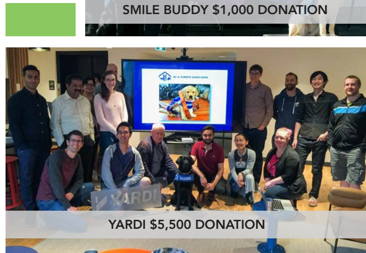
YARDI $5,500 DONATION