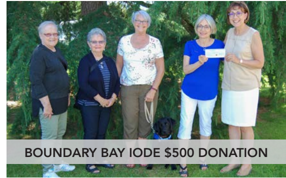
BOUNDARY BAY IODE $500 DONATION