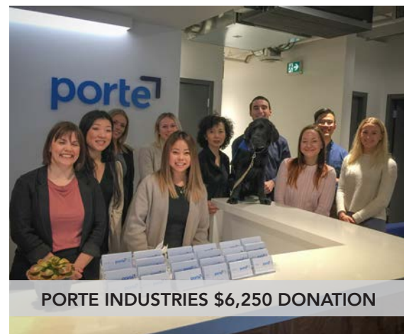
PORTE INDUSTRIES $6,250 DONATION