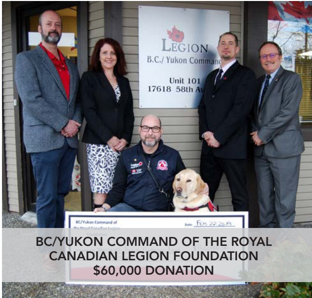
BC/YUKON COMMAND OF THE ROYAL CANADIAN LEGION FOUNDATION $60,000 DONATION