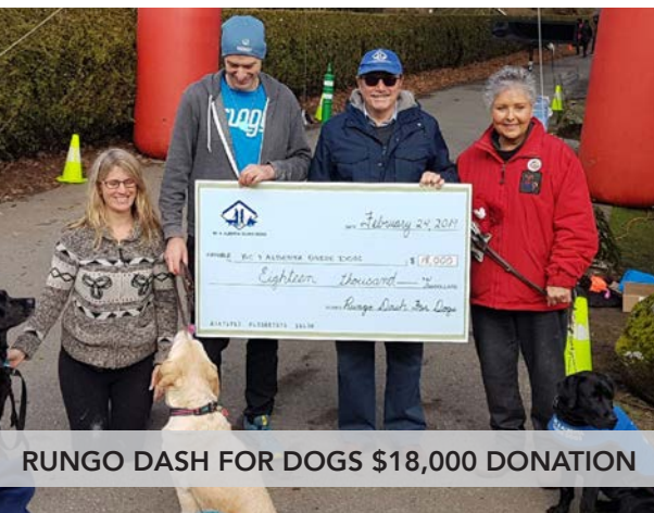
RUNGO DASH FOR DOGS $18,000 DONATION