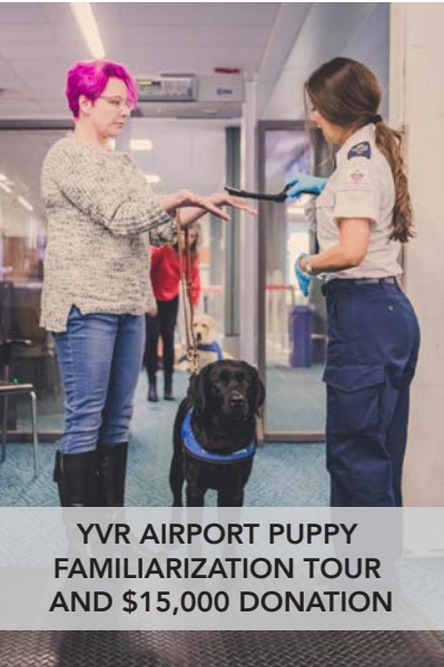
YVR AIRPORT PUPPY FAMILIARIZATION TOUR AND $15,000 DONATION

We are grateful to the individuals and businesses that choose to support us throughout the year! Your generosity helps provide Guide Dogs to individuals who are blind/visually-impaired, Autism Support Dogs to children ages 3-10 with profound autism and their families, and PTSD Service Dogs for Veterans living with an Operational Stress Injury.